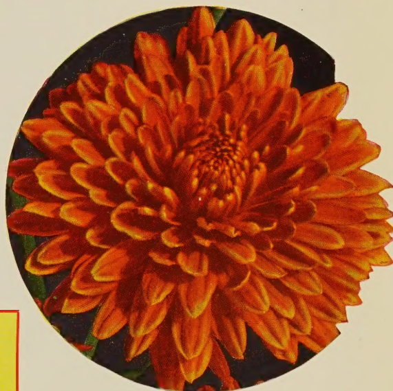
AUTUMN BEAUTY. 50c each; 3 for $1.25